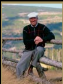
Tom Weiskopf, Yellowstone Club's Golf Course Designer

At an average elevation of 7,500 feet, the stunning vistas from Yellowstone Club's Tom Weiskopf-designed championship golf course may cost players a few strokes from sheer distraction. Tom, former British Open and Senior Open Champion, has a singular passion for high-altitude terrain, which has earned him the reputation with players and the media as perhaps the premier designer in mountain golf.