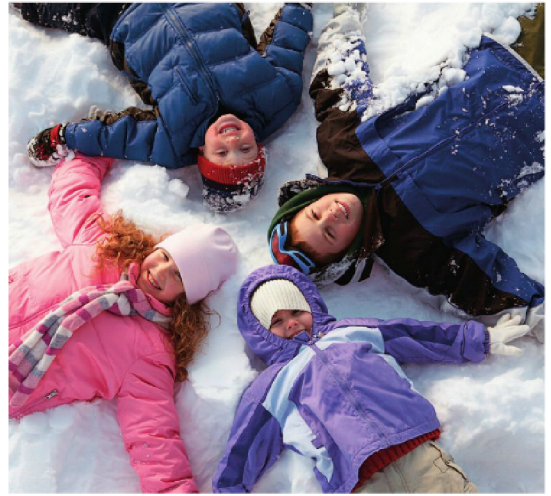
Clockwise from top left: The surface of Idaho's Lake Pend Oreille is carved by a wakeboarder. Kids make snow angels at California's Mammoth Mountain. A couple launches a canoe on Sparks Lake in Oregon. A family hikes on Crystal Mountain in Washington. Swinging from the fairway at Montana's Yellowstone Club.