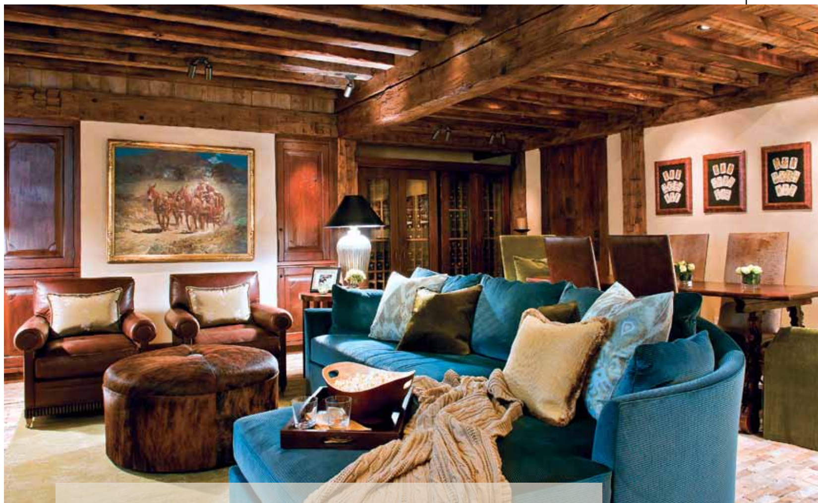
The crowd-friendly lower level of the home is primed for après-ski entertaining, with a well-stocked wine cellar, dining area, leather club chairs and a large and inviting custom blue sectional sofa. Reclaimed hardwood floors, structural square beams and stripped logs coexist with more refined wood paneling and hand-carved cabinetry, and all have been given a timeworn patina. FACING PAGE: Anchoring the stairway, Pearson designed a sturdy newel post made from the base of a tree, to look, he says, "as if the house was built up around that tree."

The building materials used inside the house are just as simple as those used outside, but their application is anything but basic. Organic timbers are >>