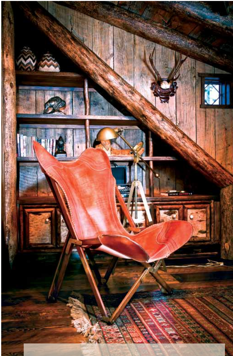
ABOVE: Pearson took a gentler approach to the home's interior details: The wood is waxed, oiled and sanded, making it soft to the touch and giving the interiors textural interest. A cozy reading nook, nicknamed the "Hemingway Hideaway," features a leather campaign chair. RIGHT: The architect intentionally left the exterior of the house sun-bleached and rustic to help tie the structure into the dramatic landscape. The materials were inspired by backcountry cabins in nearby Glacier National Park.

"EACH SURFACE INSIDE THE HOUSE HAS BEEN HAND-POLISHED, MAKING IT SMOOTH TO THE TOUCH. YOU'RE NOT GOING TO GET YOUR CLOTHES HUNG UP ON THEM. THAT'S THE TRICK: IT'S RUSTIC, BUT IT HAS TO BE USER-FRIENDLY."