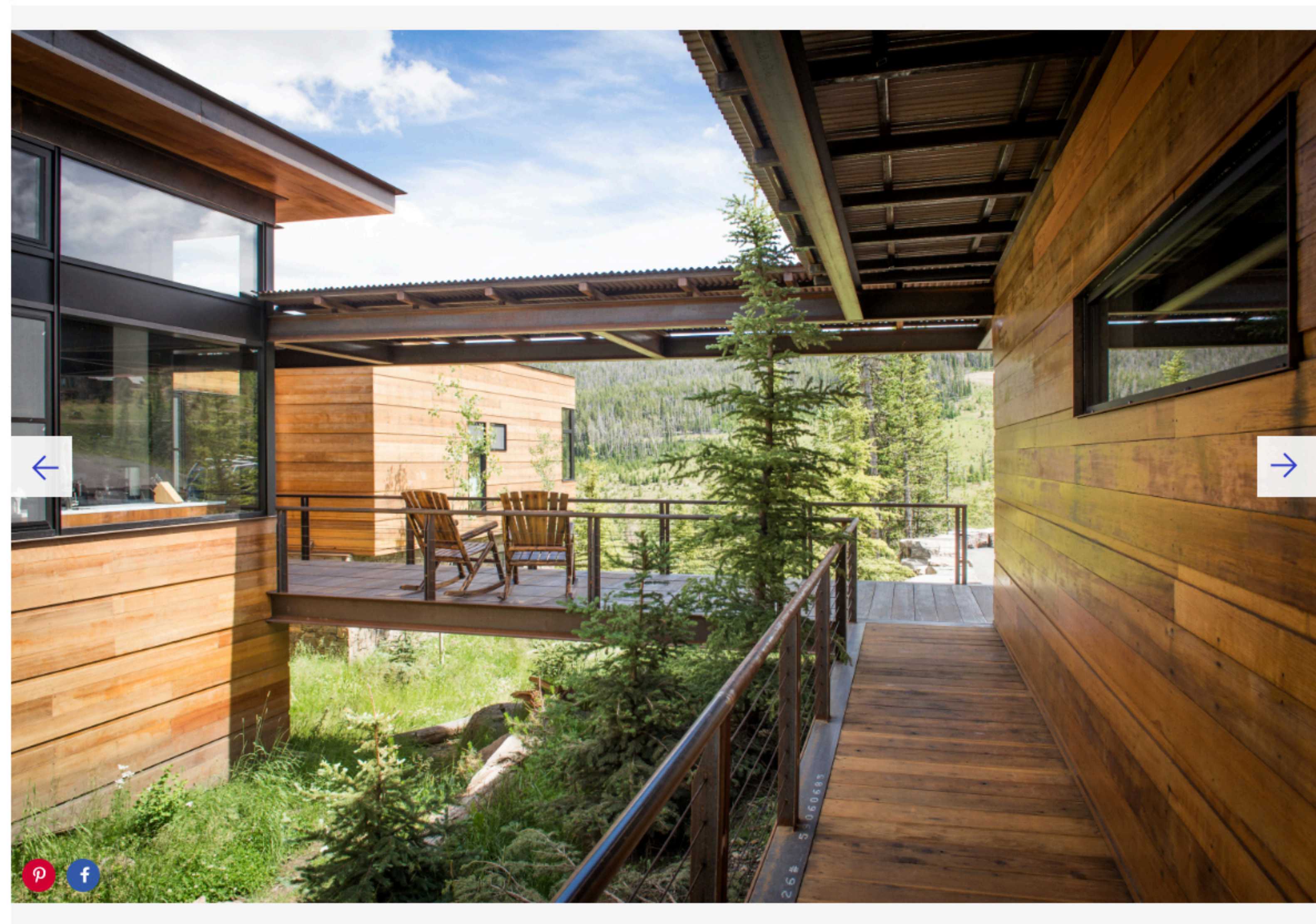
Covered walkways join various parts of the home.