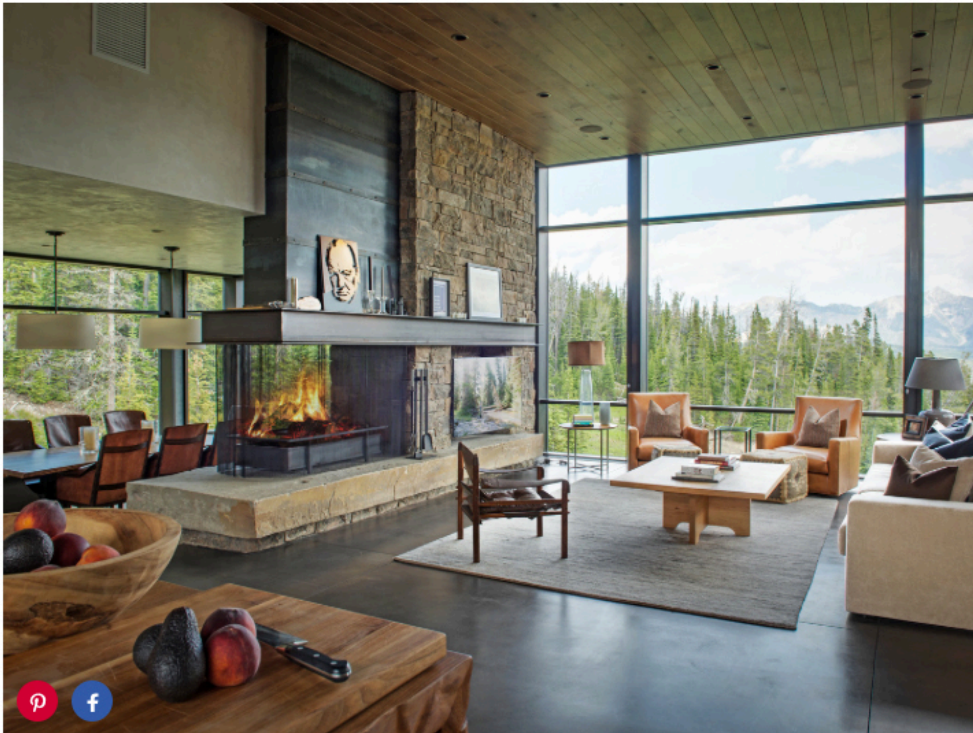
This rustic-chic retreat on the slopes of Big Sky has unobstructed alpine views.