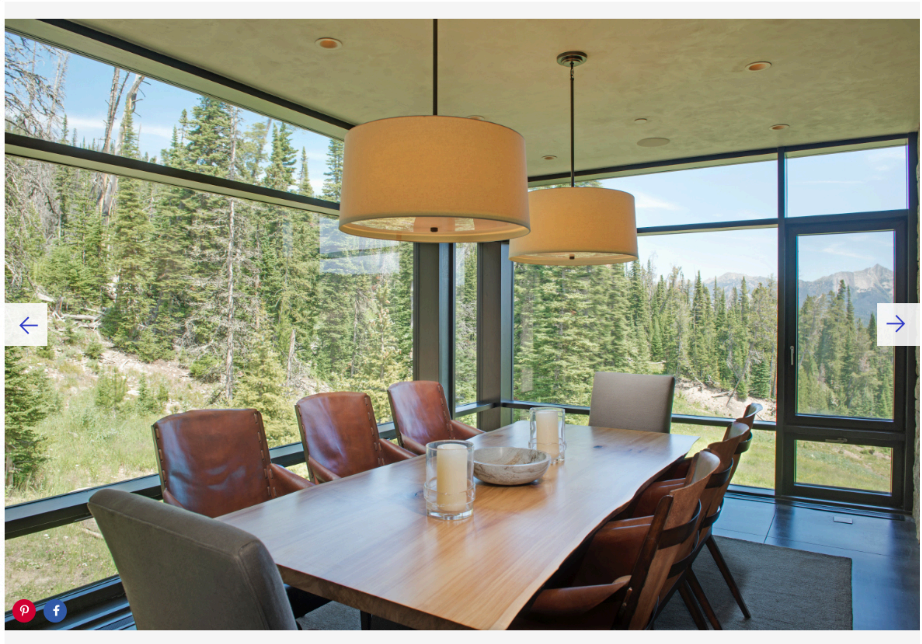
The glass-walled dining room looks out on the mountains.