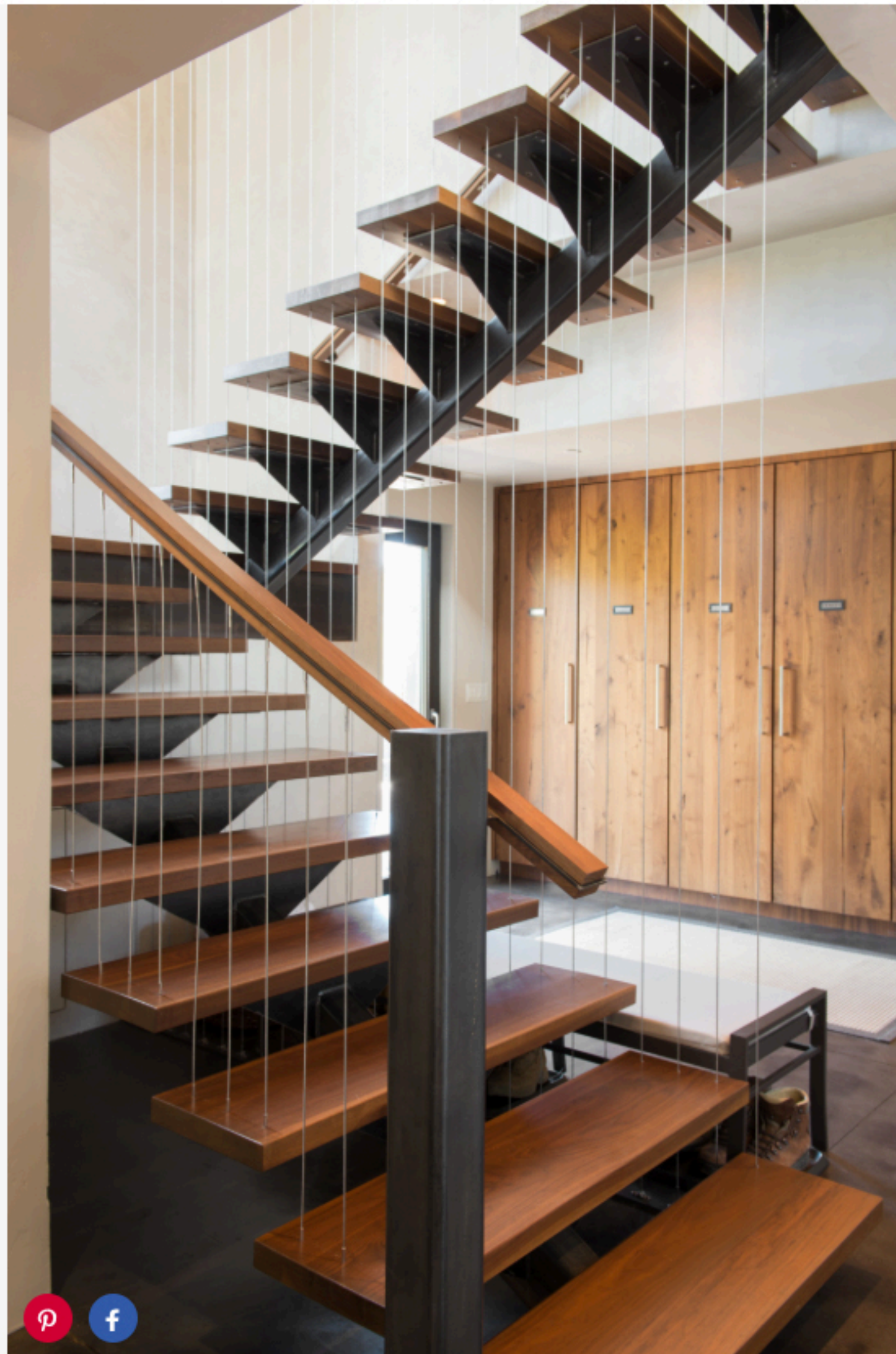
A floating staircase lends an interesting architectural element to the interior.