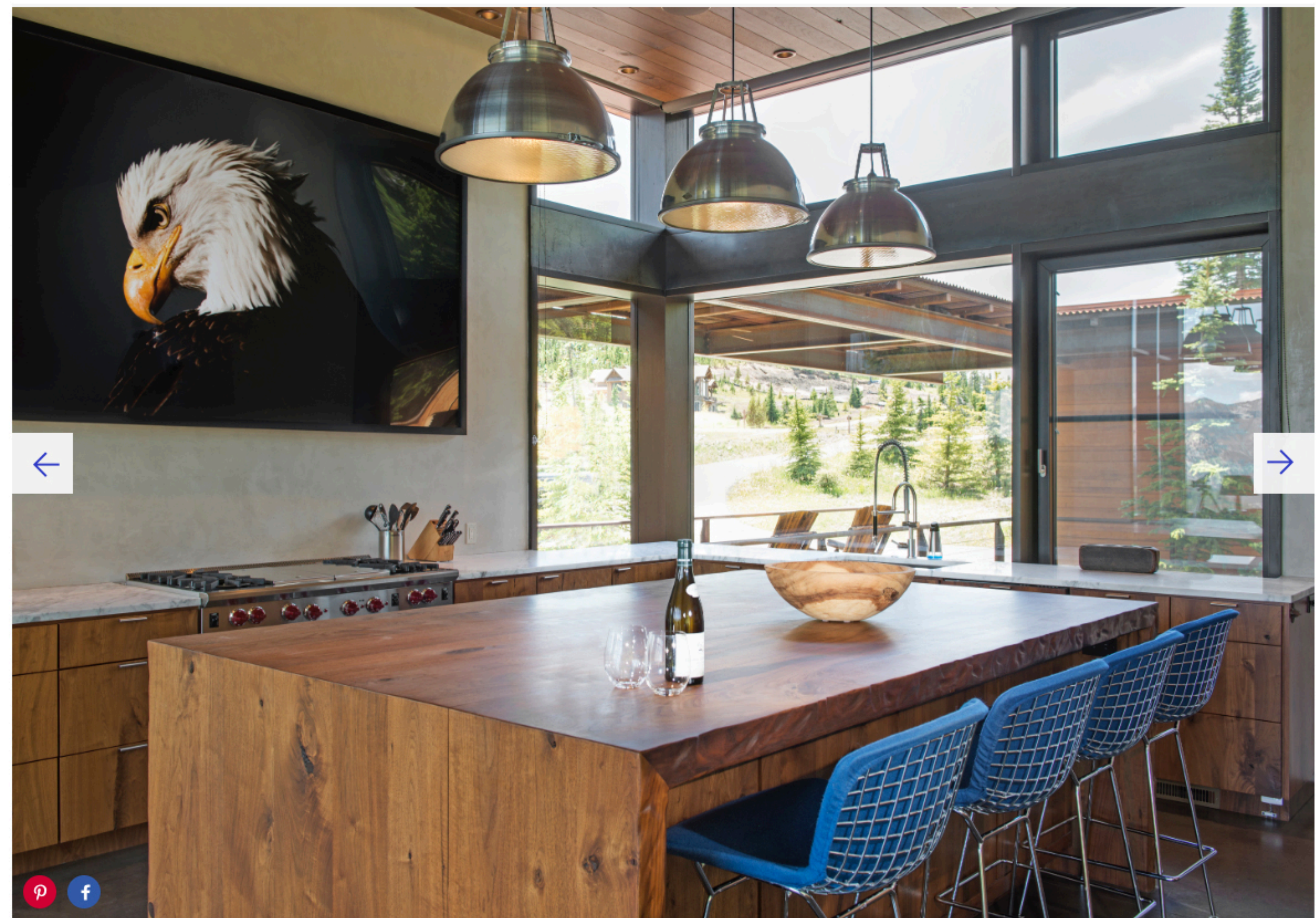
The spacious kitchen has a breakfast bar.